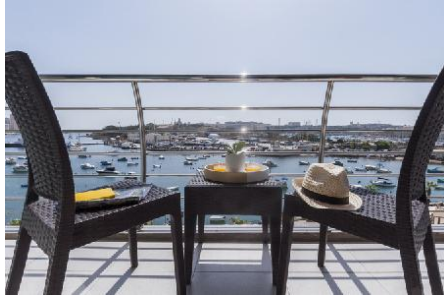
1 bedroom seaview apartment