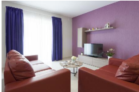
3 BR Apartment Inland