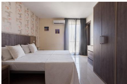
Two Bedroom Inland