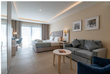
Juniorsuite with Balcony