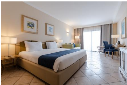
JuniorSuite Graden View