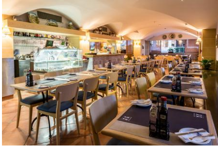
AI Ponte Pizzeria