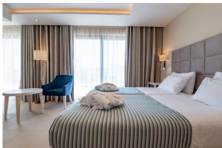
Deluxe Room with Balcony