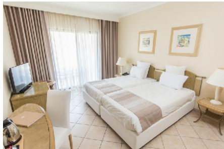
Double Room with balcony