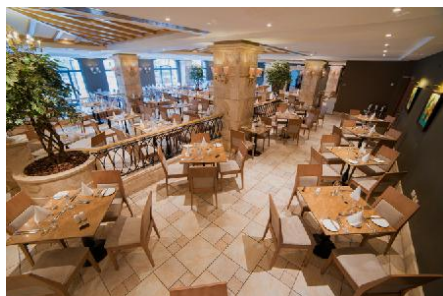
Les Jardins Restaurant