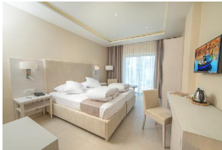
Deluxe Room Garden View