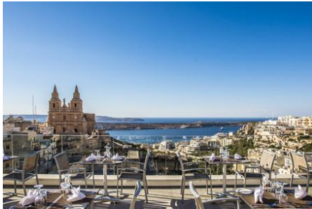
AI Fresco Restaurant