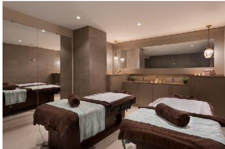
Spa and Wellness