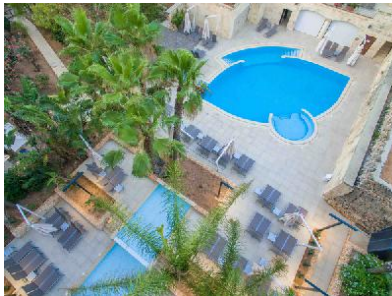
Garden Pool Aerial View