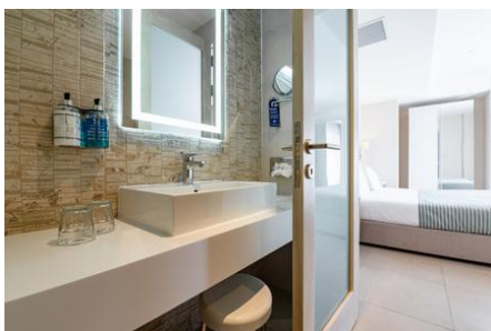
Deluxe Juniorsuite with Balcony