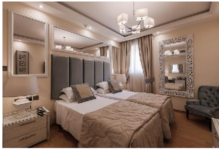
Superior Sea View Room

Destination: Malta Handling: Malta Office Group: Chain: Owner: DONOTUSE-Malta Accomodation Provider Lat: 35.8985329 Lng: 14.5088091