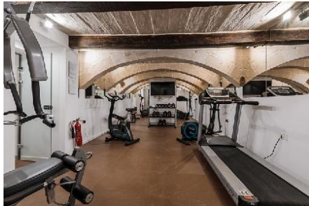
Gym and fitness area