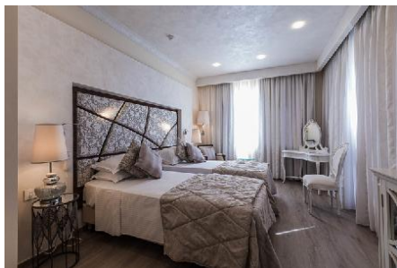
Deluxe Sea View